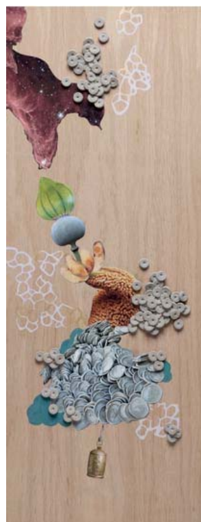
Karen Chu, "Float Away," 2011, mixed medium on panel