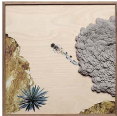
Karen Chu, "Sprout," 2011, paper & sculpey on panel

Lost & Found is a recent body of work where Karen Chu explores different interactions between subject matter, colors, forms and textures. Not unlike scattered pieces of a puzzle, a myriad of images are scavenged, found and brought together only to be scattered once again across a surface in order to form a larger narrative. These found images are the foundation and building blocks for Chu's mixed media collages, paintings and sculptures. For her collages on panel, the sculpted components often mimic the forms and textures depicted in the found images. An image of a pile of gold coins is transformed into an overlapping armadillo-like armor of physical gray sculpey "coins." Other times, the sculpted forms are derived from the oceanic themes found in Ernst Haeckel's Art Forms in Nature . These shapes transcend the panel and transform into organic ceramic sculptures reminiscent of coral reef structures. Chu, who is always floating between mediums, again returns to her collages as inspiration for her paintings on linen. The paintings are direct translations of her collages, with the raw linen and wood grain providing natural backgrounds for the images to float and hover over. The organically fused and juxtaposed elements in Chu's collages, paintings, and sculptures balance and riff off of each other to create a conversation within each piece.